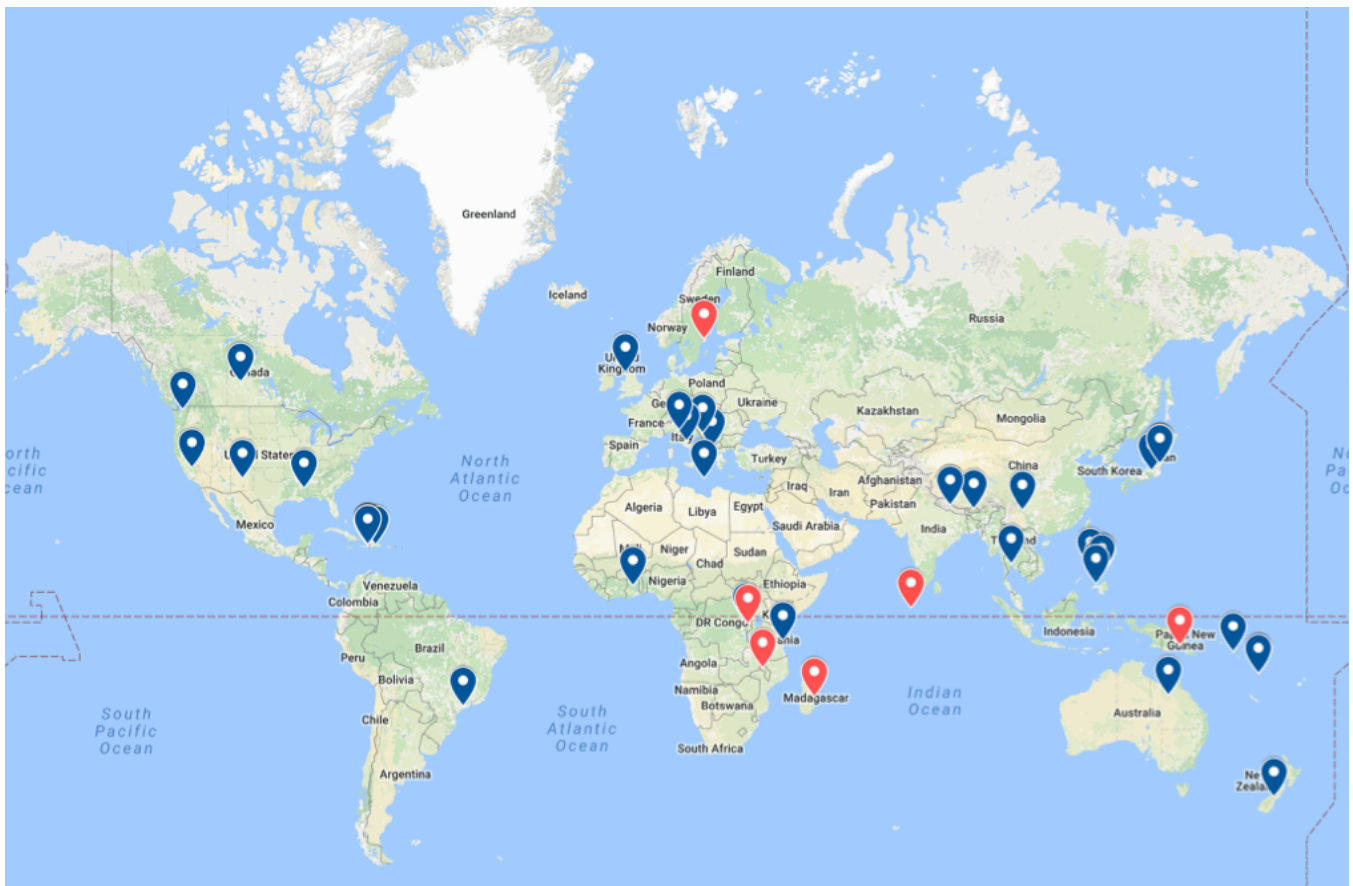
Figure 1: Map showing the locations of known humanitarian UAV projects. The data come from UAViators and can be viewed in detail in Annex 1, or as an interactive map at: https://www.google.com/maps/d/viewer?mid=IwdligD6V9KZFd_vaCOVGA_Rn-II&ll=5.140328190247929%2C-16.071904899999907&z=3