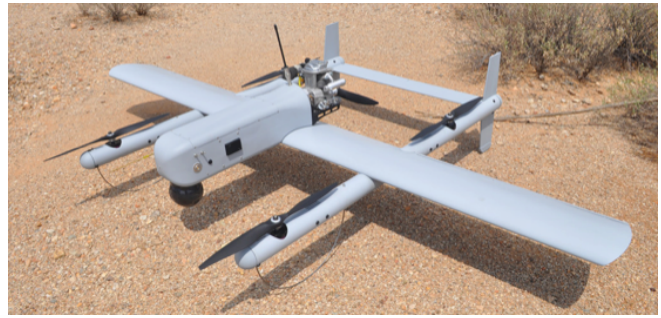
Picture 3: Hybrid UAV

Hybrid drones are a new but promising concept, as they are equipped with both wings and rotors which allow for vertical takeoff and landing (like the multi-rotor drone) as well horizontal flight like fixed-wing drones. This makes it possible to cover longer distances and carry heavier cargo than multi-rotor drones. Similar software applications are available for hybrid drones as for fixed-wing and multi-rotor drones.