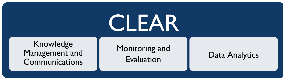
Exhibit 7. CLEAR team composition

The Monitoring and Evaluation unit is primarily responsible for all centrally managed M&E activities. This unit develops and rolls out M&E policies, procedures, tools, templates, and methods; provides training and guidance to in-country M&E personnel; and ensures data quality. The M&E unit works in close collaboration with the MIS team to ensure that ARTMIS forms and dashboards accurately capture and display indicator information. The team also works across headquarters technical and functional units to ensure that teams have the data they need to identify problems, make decisions, and evaluate progress toward the project’s objectives. Members of the M&E unit also conduct short-term technical assistance assignments in field offices, those geared toward supporting the field office’s M&E activities and those providing M&E systems strengthening support to government counterparts.