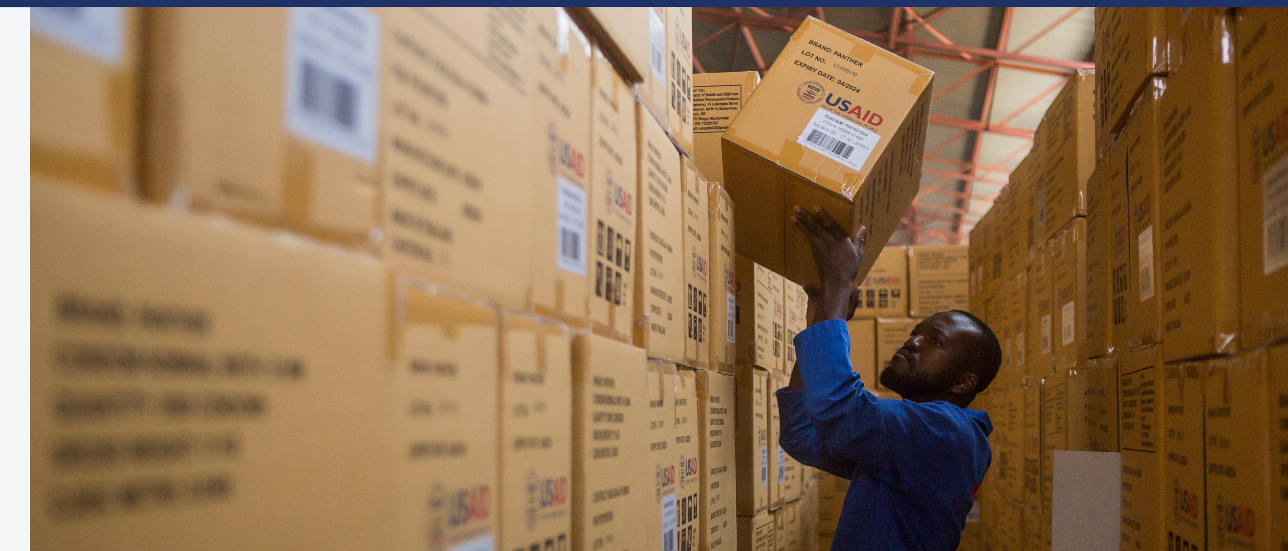
Warehouse employee in Zimbabwe arranging HIV/AIDS commodities.

With support from the U.S. President's Emergency Plan for AIDS Relief, through the United States Agency for International Development, Global Health Supply Chain Program-Procurement and Supply Management (GHSC-PSM) project conducted this research. GHSC-PSM is funded under USAID Contract No. AID-OAA-I-15-0004. GHSC-PSM connects technical solutions and proven commercial processes to promote efficient and cost-effective health supply chains worldwide. The views expressed in this poster do not necessarily reflect the views of USAID or the U.S. government. PSM 01 00059.