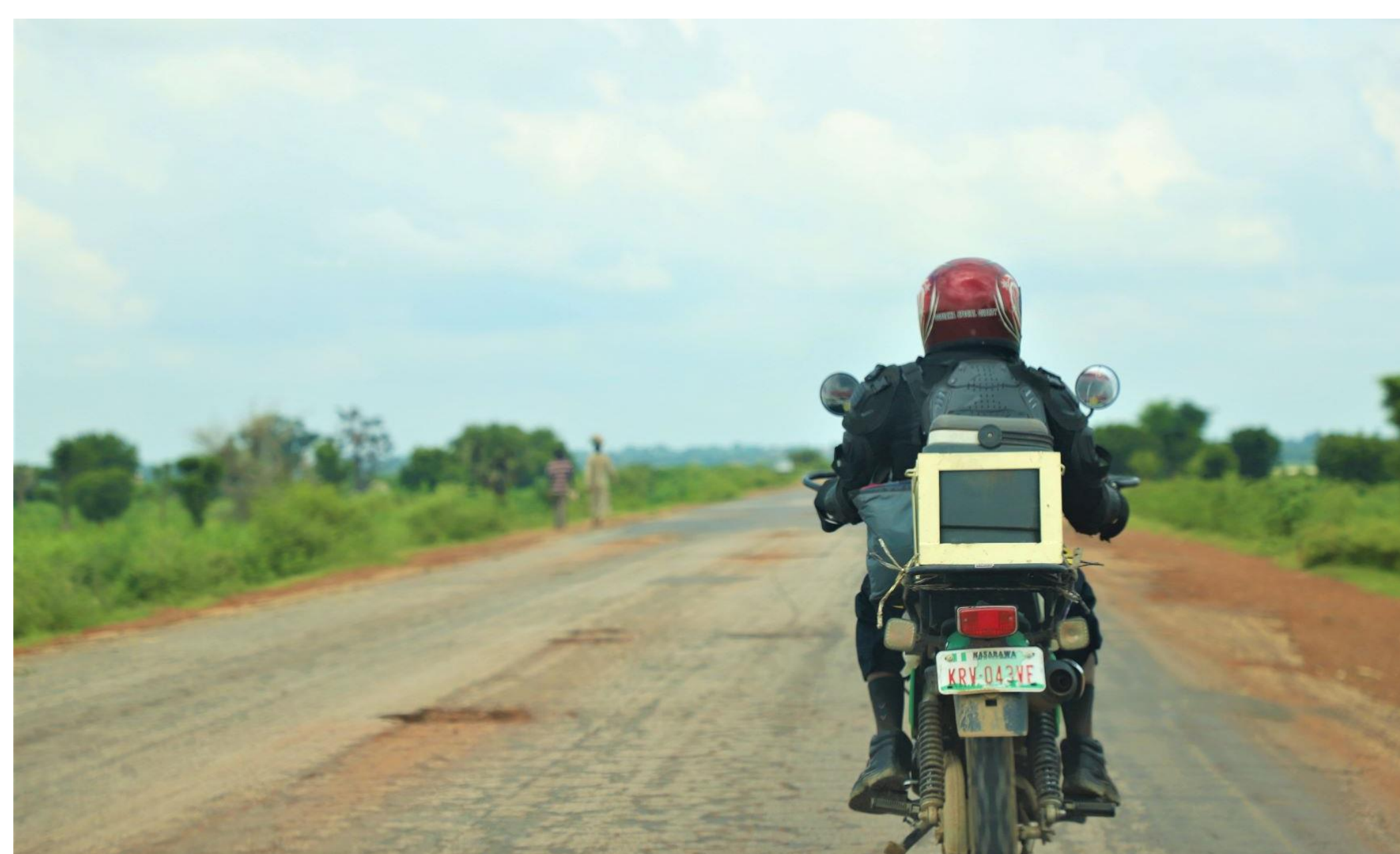
HIV samples transported by motorbike in Nigeria.

Following implementation, GHSC-PSM carried out a comparative analysis of two periods – December 2019-January 2020 and March-April 2020 – to measure the impact of the VMMHS strategy on NiSRN.