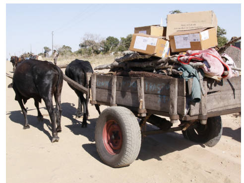
Last mile deliveries of medical supplies from Nalolo District Health Office to Nakatwelenge Health Post in Nalolo District.