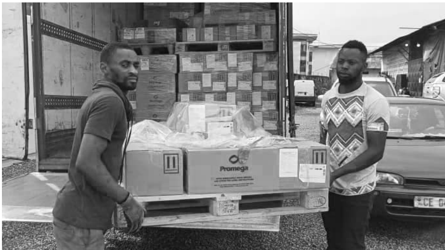
Offloading of GHSC-PSM-procured viral load commodities at Cameroon's National Public Health Laboratory.

certain level — also scaled up globally to curb rising new HIV infection rates and has improved treatment outcomes. This VL scale-up included scale-up of molecular early infant diagnosis (EID).