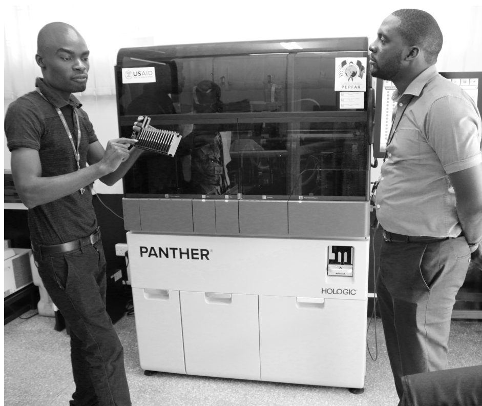
In Zambia, a demonstration on how to use a high-volume viral load testing machine.

In Haiti, GHSC-PSM worked with USAID, CDC, and national VL sites to address equipment breakdowns and service interruption. The working group identified spare parts for the equipment that breaks down most often. GHSC-PSM worked with the key equipment supplier and the in-country distributor to establish a new depot for standard in-country inventory of high-failure-rate parts. This new spare parts depot will increase instrument uptime and