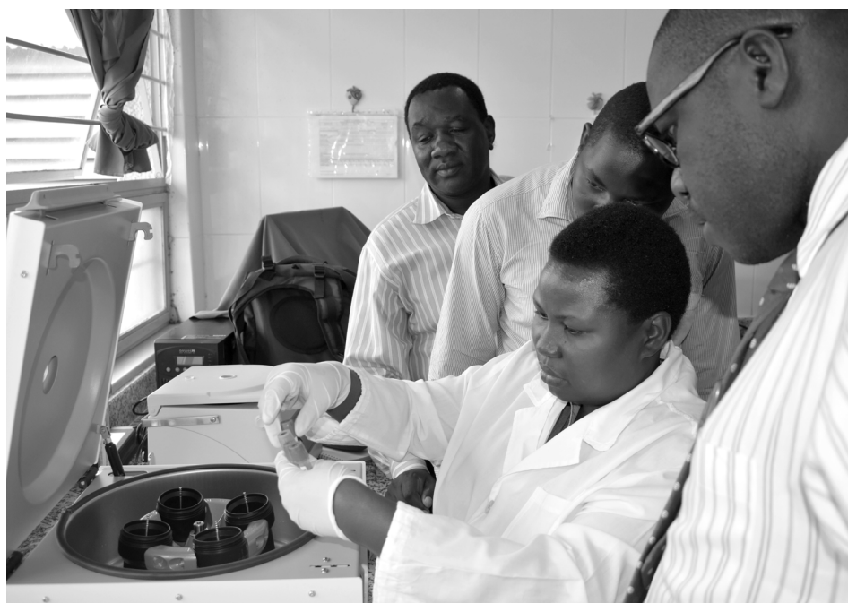
Viral Load Equipment Installation at Anaka Hospital, Uganda.

The sections below will describe each component in detail, as well as examine progress made in countries toward implementing a network approach to laboratory services, and will discuss the results of donors' efforts to secure global pricing and maintenance service agreements for country laboratory networks through global requests for proposal (RFPs).