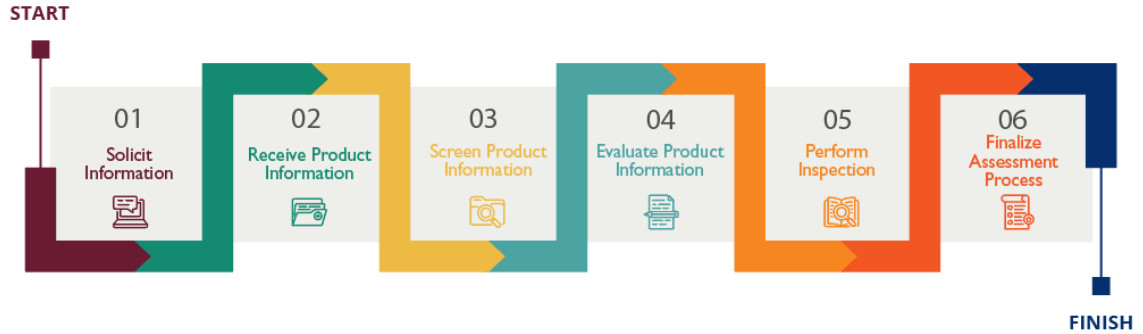
Figure 3: Prequalification process

Figure 3 summarizes the key steps in the prequalification process. The quality assurance approaches for each step in the prequalification process are described below.